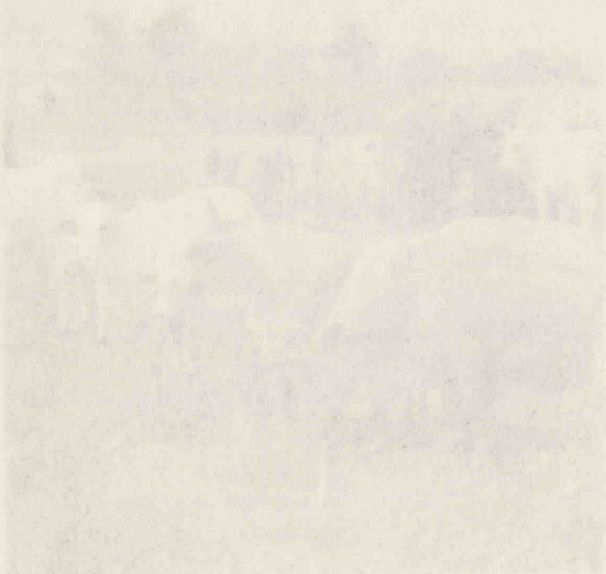
Cattle enjoying a salt lick on a project in the Markham Valley.